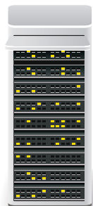
Yealink RPS Server

The Yealink T4S supports efficient provision and effortless mass deployment with Yealink's free Redirection and Provisioning Service (RPS). Furthermore, the T4S features a unified firmware and an auto-p template that apply to all phone models (T41S, T42S, T46S and T48S), saving even more time and IT costs for businesses.