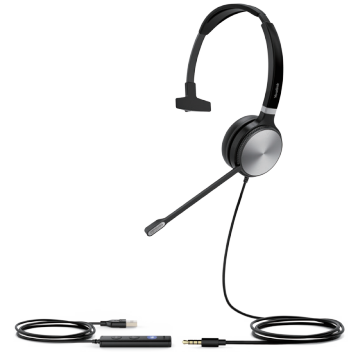
UH36 Mono Teams UH36 Mono UC

Deeply integrated with Yealink IP phones that the advanced features, such as volume synchronization and multiple calls control, are just right at your fingertips.