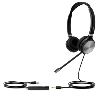
UH36 Dual Teams UH36 Dual UC